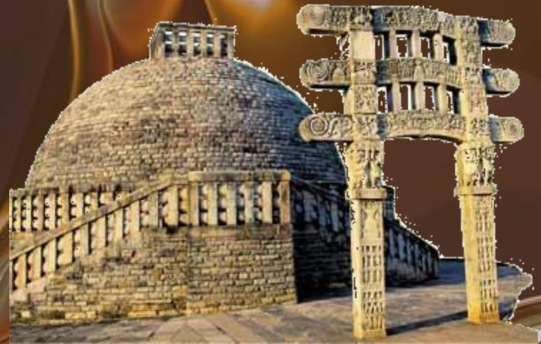
This Buddhist shrine, located in Sanchi, India, was built by Asoka.