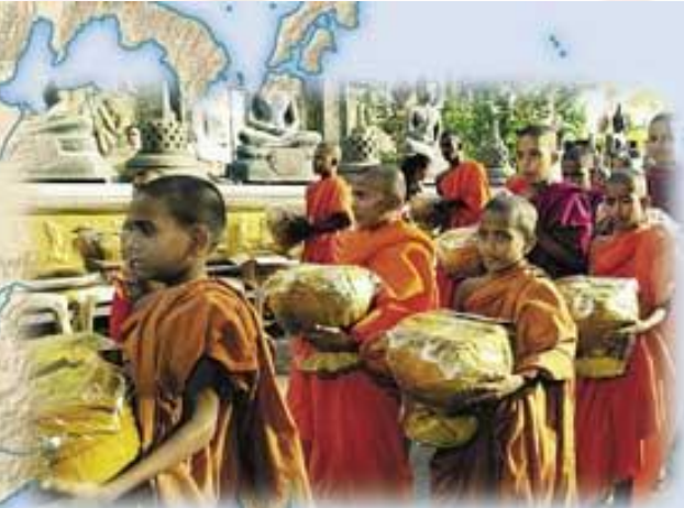
Map: Early Spread of Buddhism. Young Buddhist students carry gifts in Sri Lanka, one of the many places outside of India where Buddhism spread. The original Buddhist area included the city of Bodh Gaya. It spread south into India down into Sri Lanka, northwest into Persia, north into Central Asia and across the Bay of Bengal into Southeast Asia. The inset photo shows young Buddhists carrying gifts into Sri Lanka. These children are dressed in red and orange robes. They are carrying things in their hands. Th