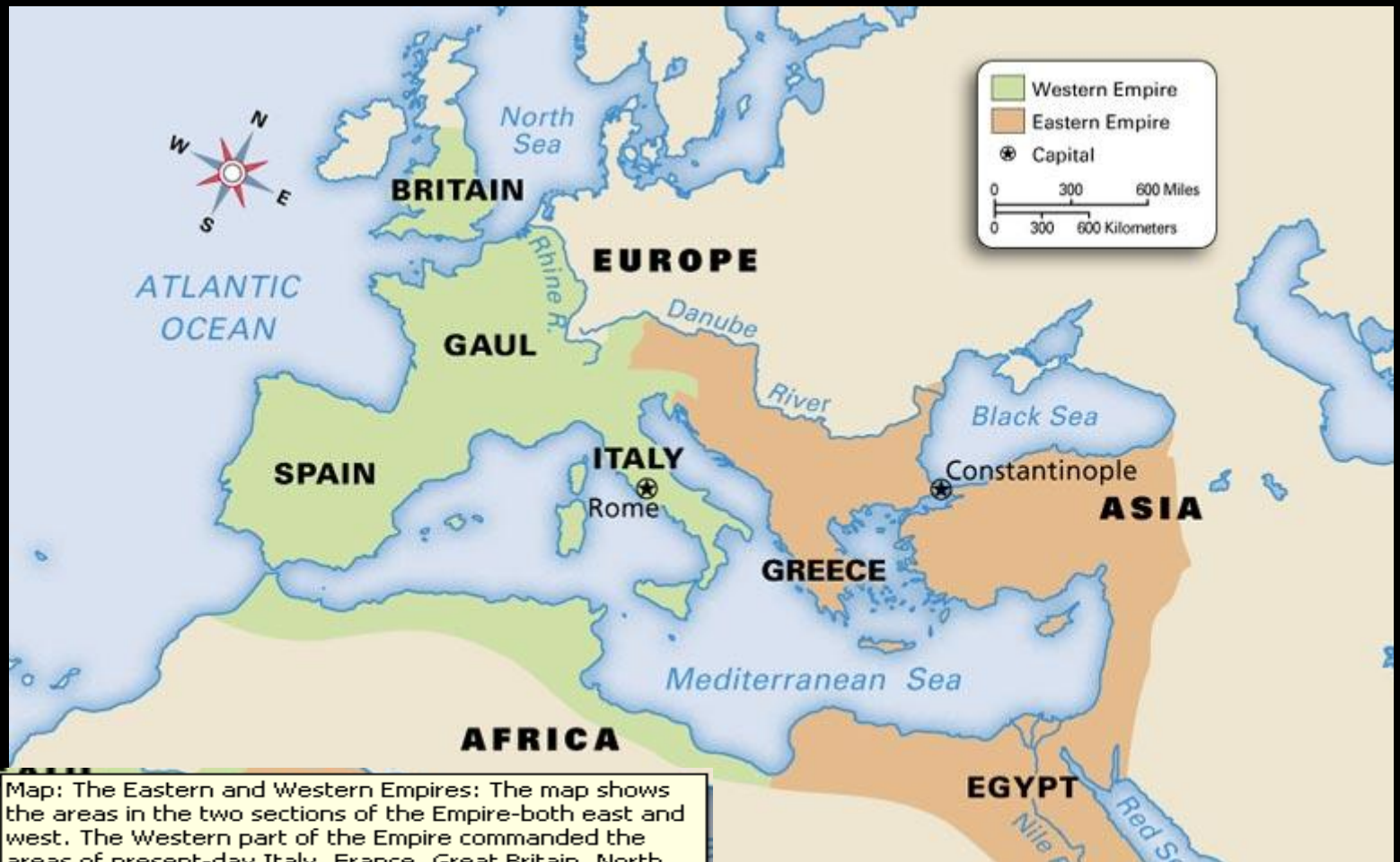
Map: The Eastern and Western Empires: The map shows the areas in the two sections of the Empire—both east and west. The Western part of the Empire commanded the areas of present-day Italy, France, Great Britain, North Africa and Spain. The Eastern part of the Empire was from present-day eastern Europe to the Middle East and eastward to southwest Asia. The eastern part of the Empire also included Egypt. Inset is a world map with the area of the main map highlighted.