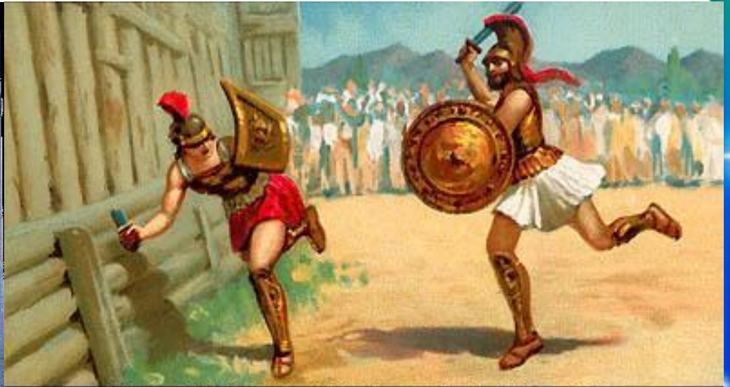
Victoire d'Enée. Liebig 1927.