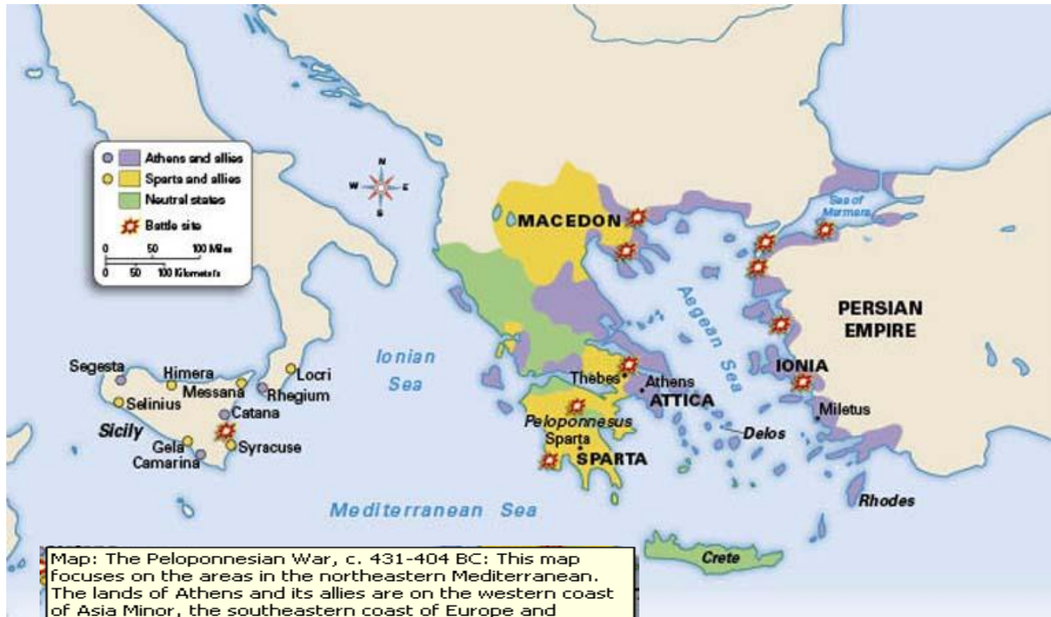
Map: The Peloponnesian War, c. 431-404 BC: This map focuses on the areas in the northeastern Mediterranean. The lands of Athens and its allies are on the western coast of Asia Minor, the southeastern coast of Europe and western Greece. The areas controlled by Sparta include Peloponnesus and Macedonia. The areas in western Greece and the island of Crete were considered neutral states. On the island of Sicily, both Sparta and Athens had multiple outposts. Battle sites are marked all along the west coast of Asia