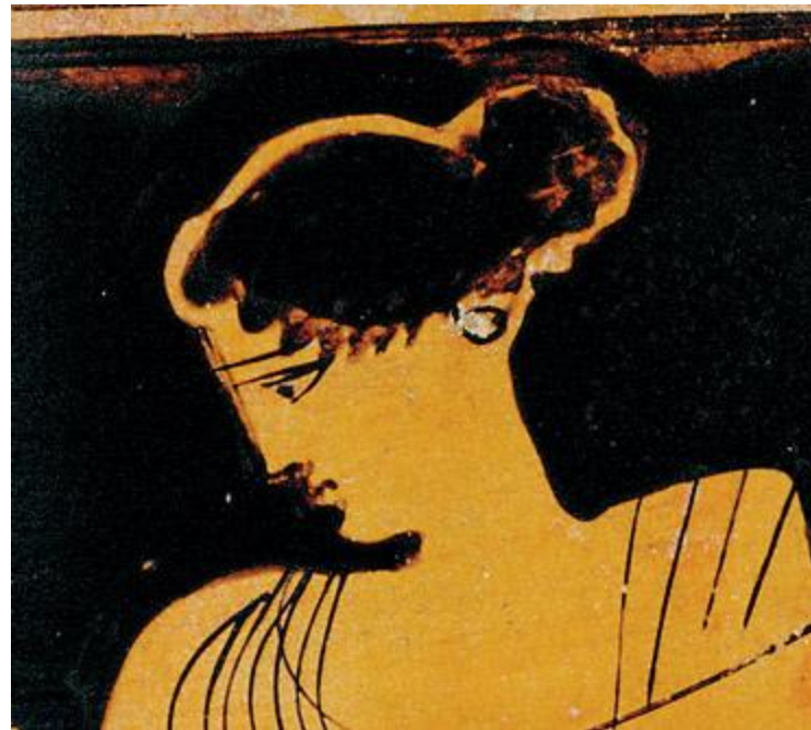
Picture of an Athenian female. The female is standing up and she appears to be holding some type of material.