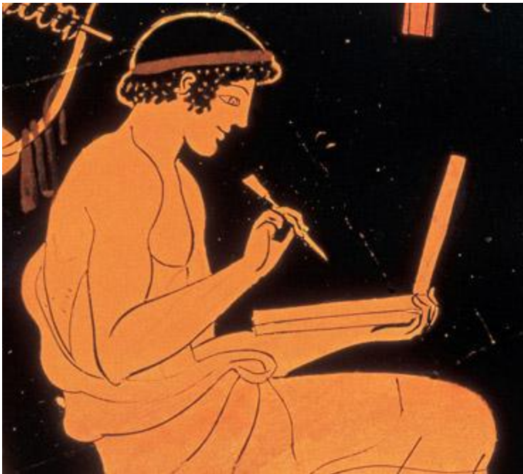
Picture of an Athenian male. There is a side view of the male. He is sitting down and appears to be writing in an open book or tablet.